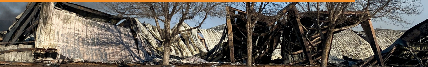
The Ellensburg Racquet & Recreation Center was destroyed in an early morning fire on December 2, 2022.

Replacing Ellensburg Racquet & Recreation Center Lost in Fire on 12/2/2022